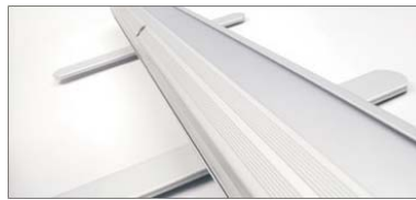
Two stabilizing feet for improved upright support.