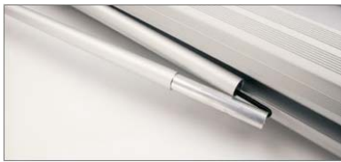
Tri-Fold Pole hides away inside display unit.

This new and improved Retractable Banner Stand includes FREE 50W halogen light, snap-lock profile, dual stabilizing feet and nylon case with shoulder strap and accessory pouch.