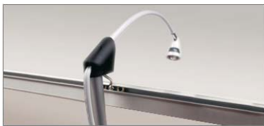
50W Halogen Light positioned on top of pole.

FREE 50W Halogen Light and Replacement Bulbs.