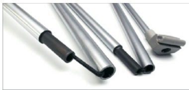
5 Piece Shock Cord Pole