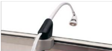
50W Halogen Light positioned on top of pole.