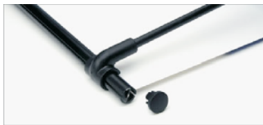
Removable profile caps for installation of pole