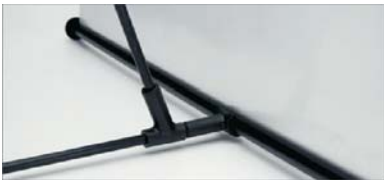
Sliding base bracket for pole installment

Lightweight Components. Easy To Assemble.